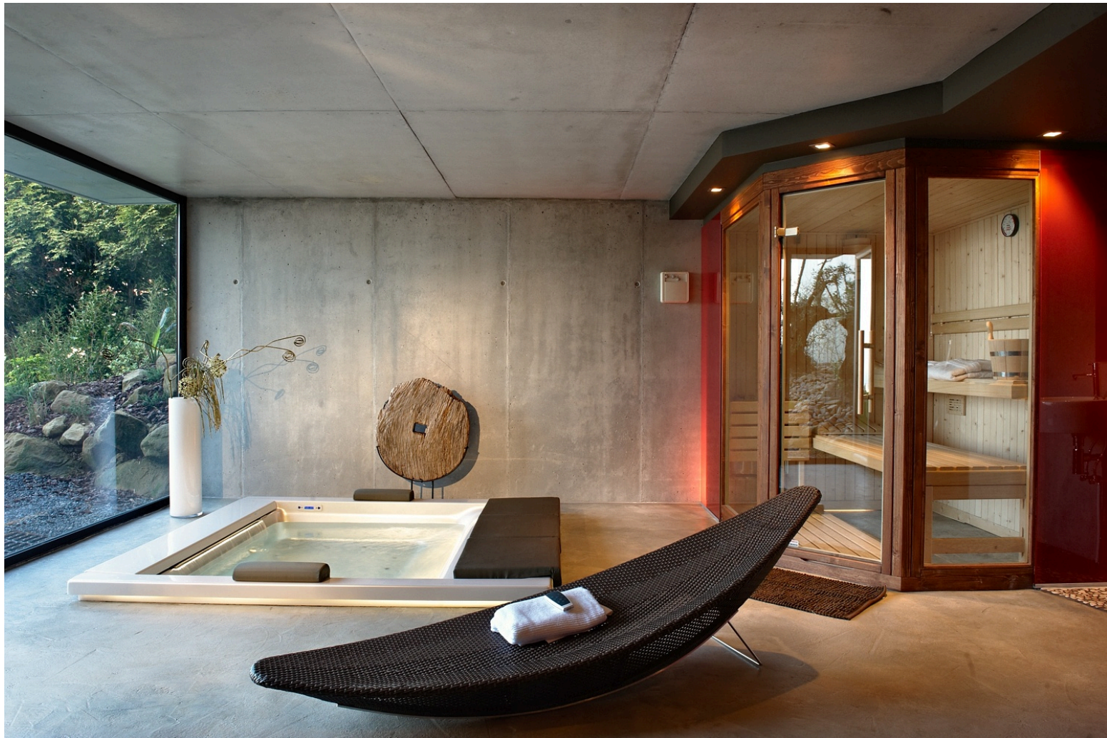
Amezti 58, San Sebastian

Details Sleeps up to seven. One night from £612, minimum five-night stay ( plumguide.com ). Fly or take the ferry to Bilbao