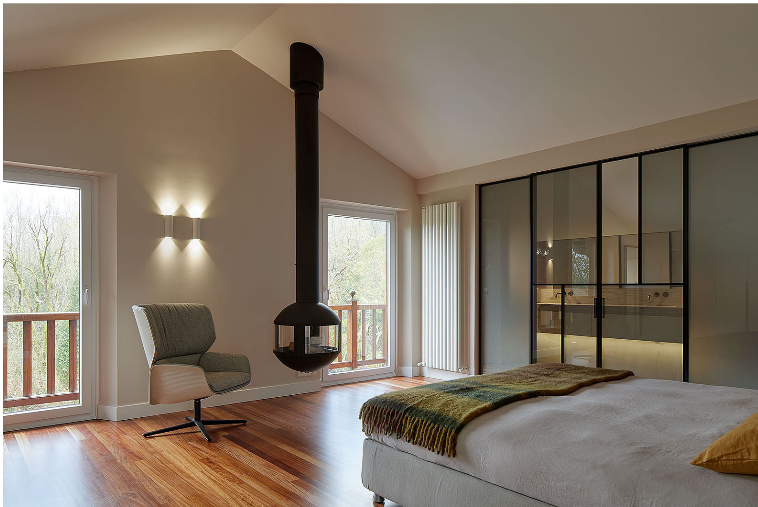
Sliding Serenity, near San Sebastian

Beyond foodie San Sebastian come craggy mountains, oak forests and waterfalls