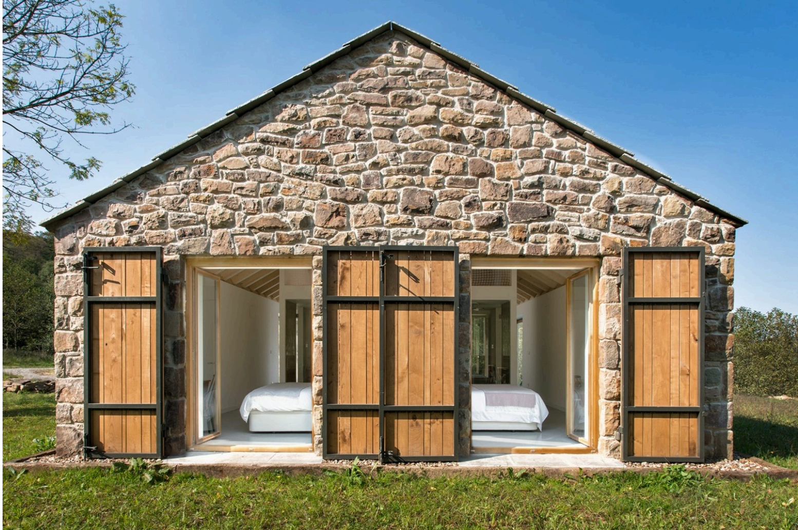
Villa Slow, La Pedrosa