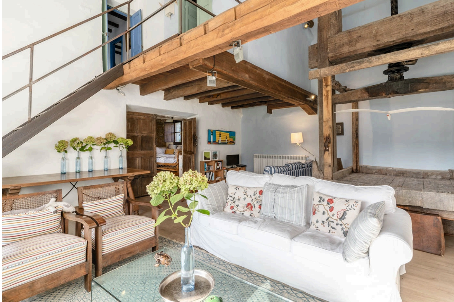
The Cider House, Rodiles