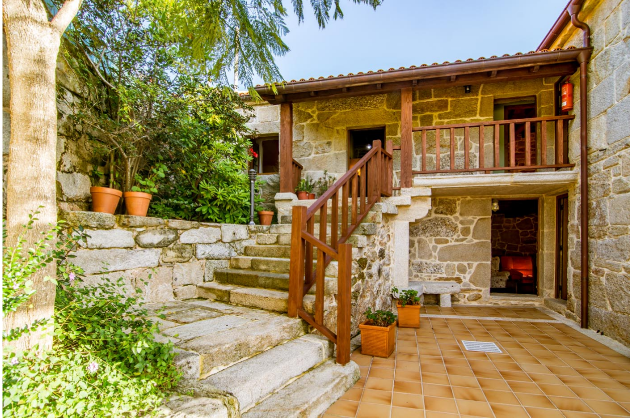
Rias Baixas, Pontevedra