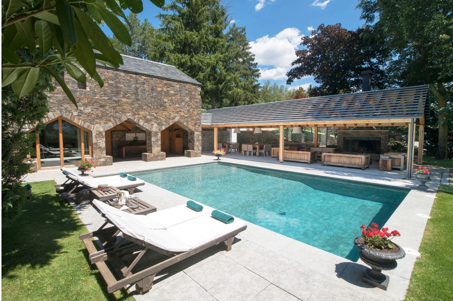
Pyrenees House, La Cerdanya