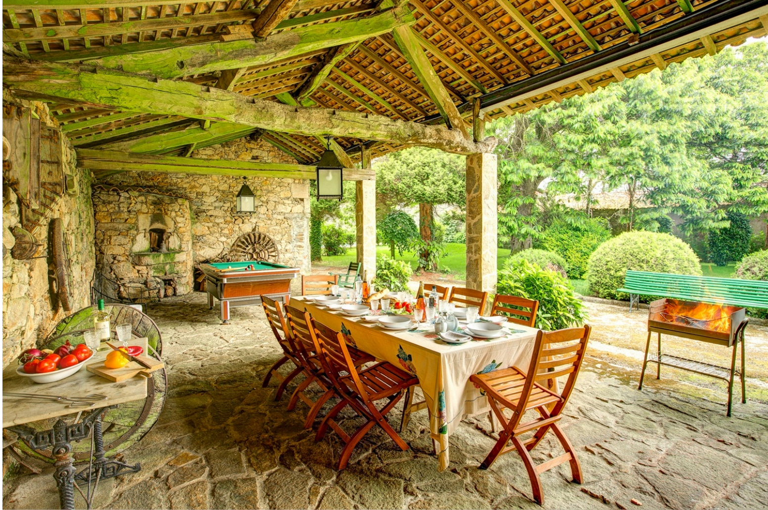
Pazo de Ceilan, Negreira