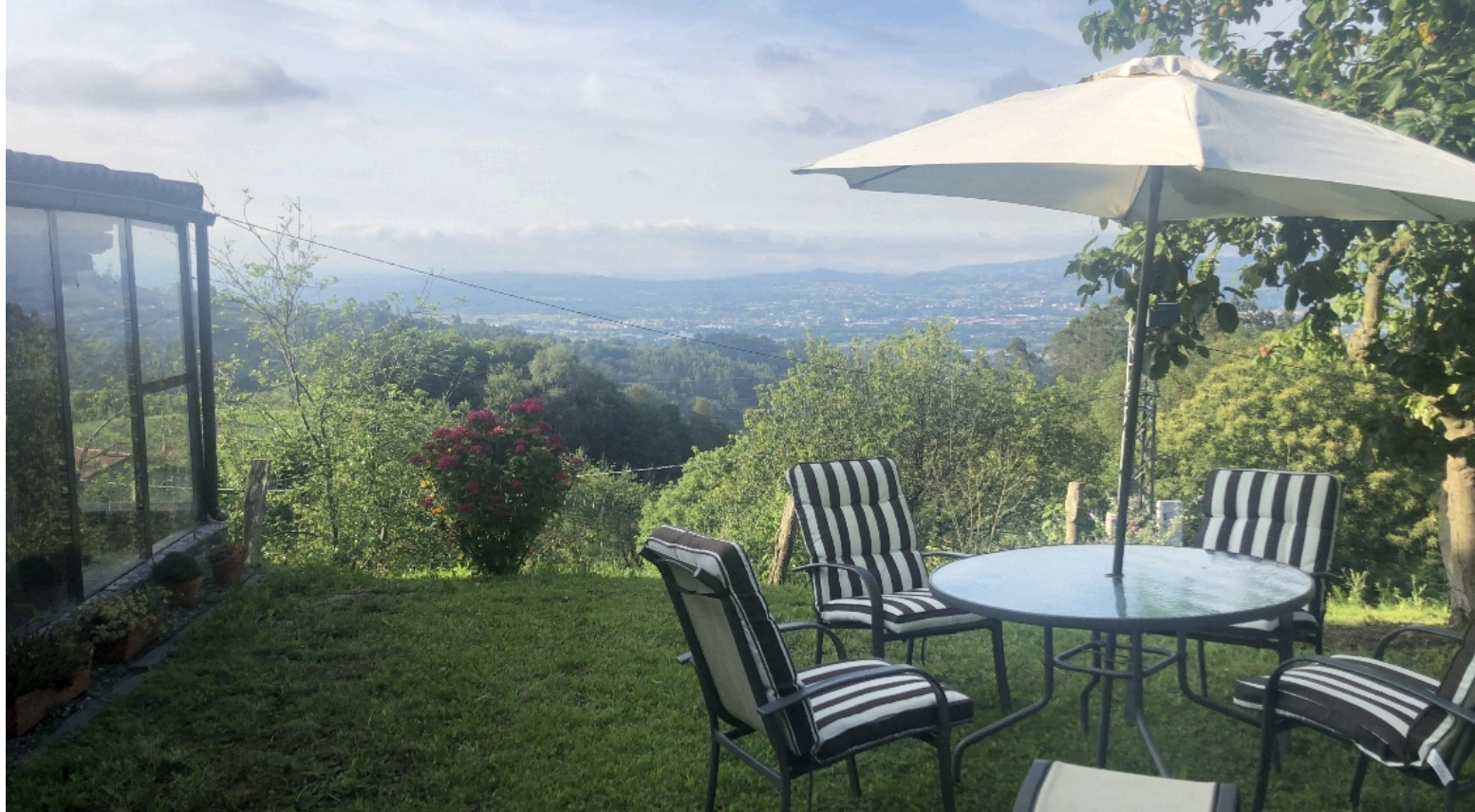
Nature House, Siero