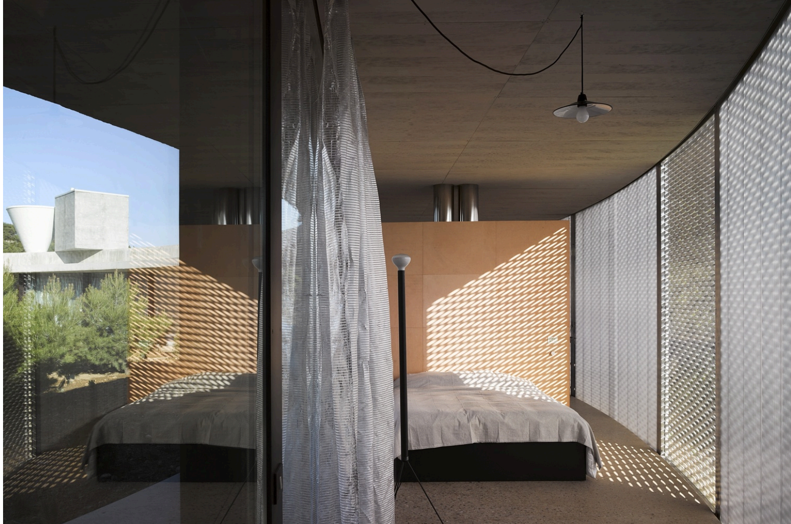
Solo Circle, Cretas