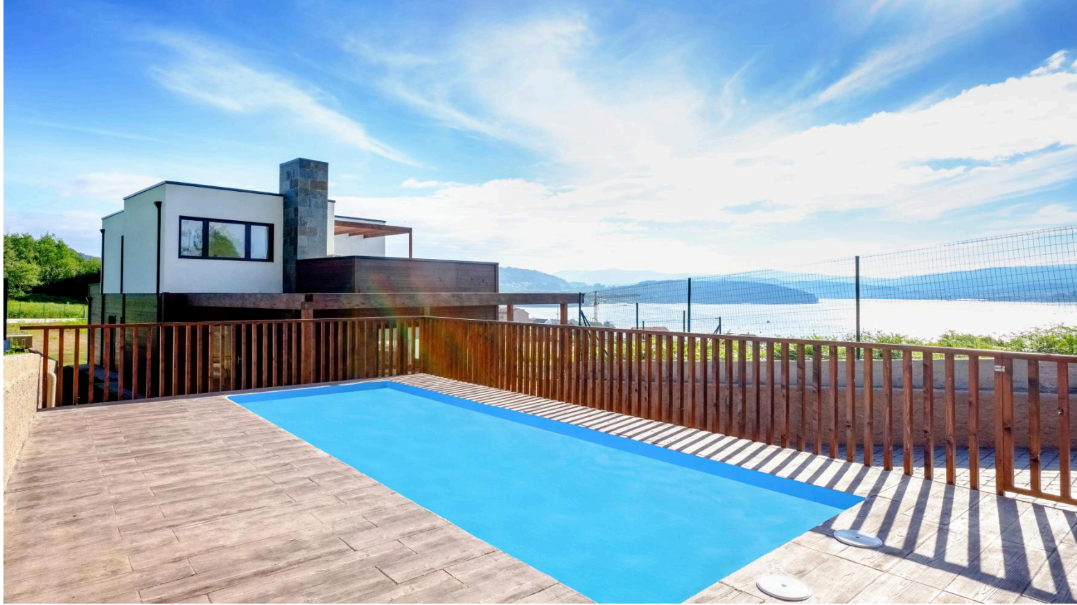
Casa Tremuzo, near Freixo