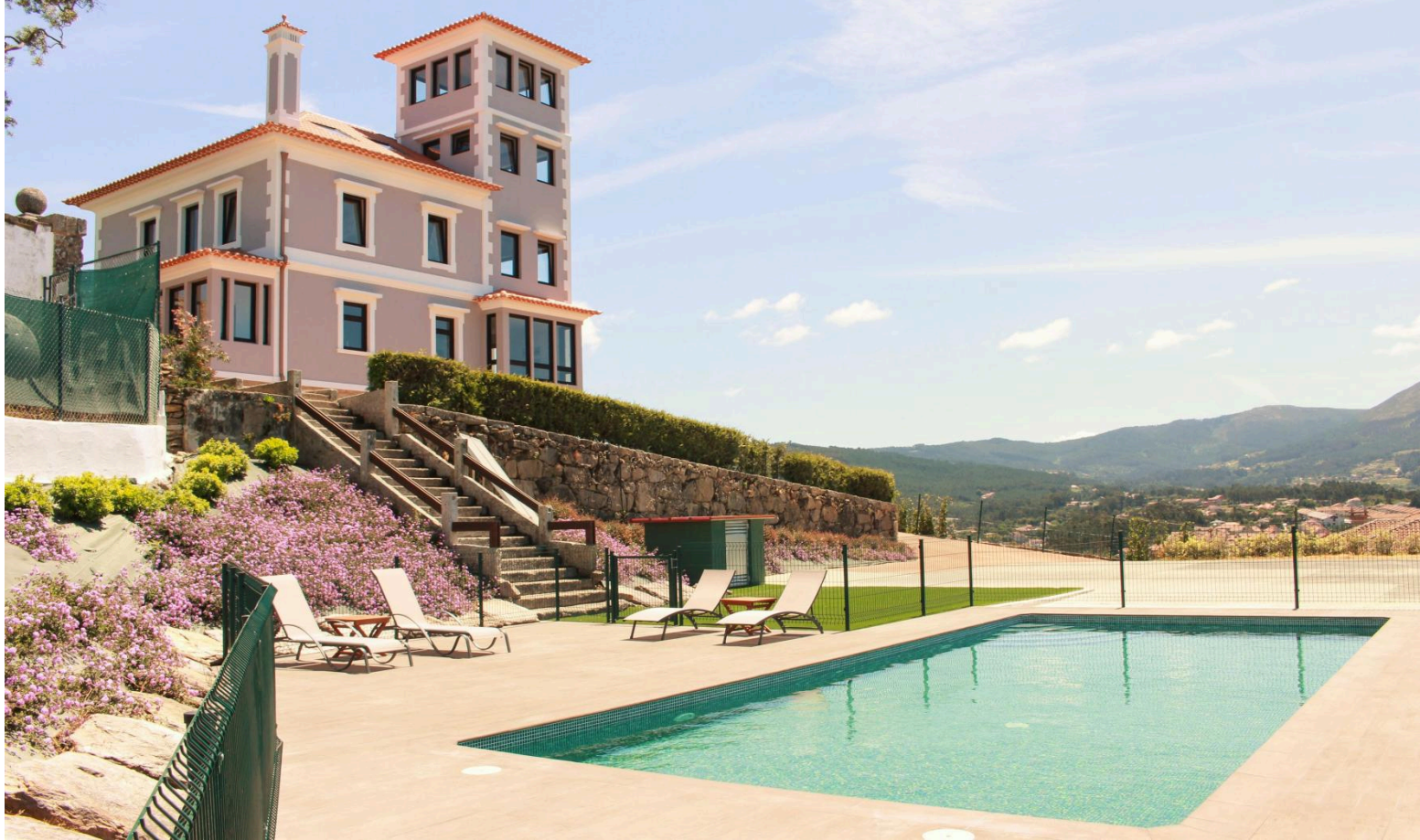
Casa Berdillo, Panxon