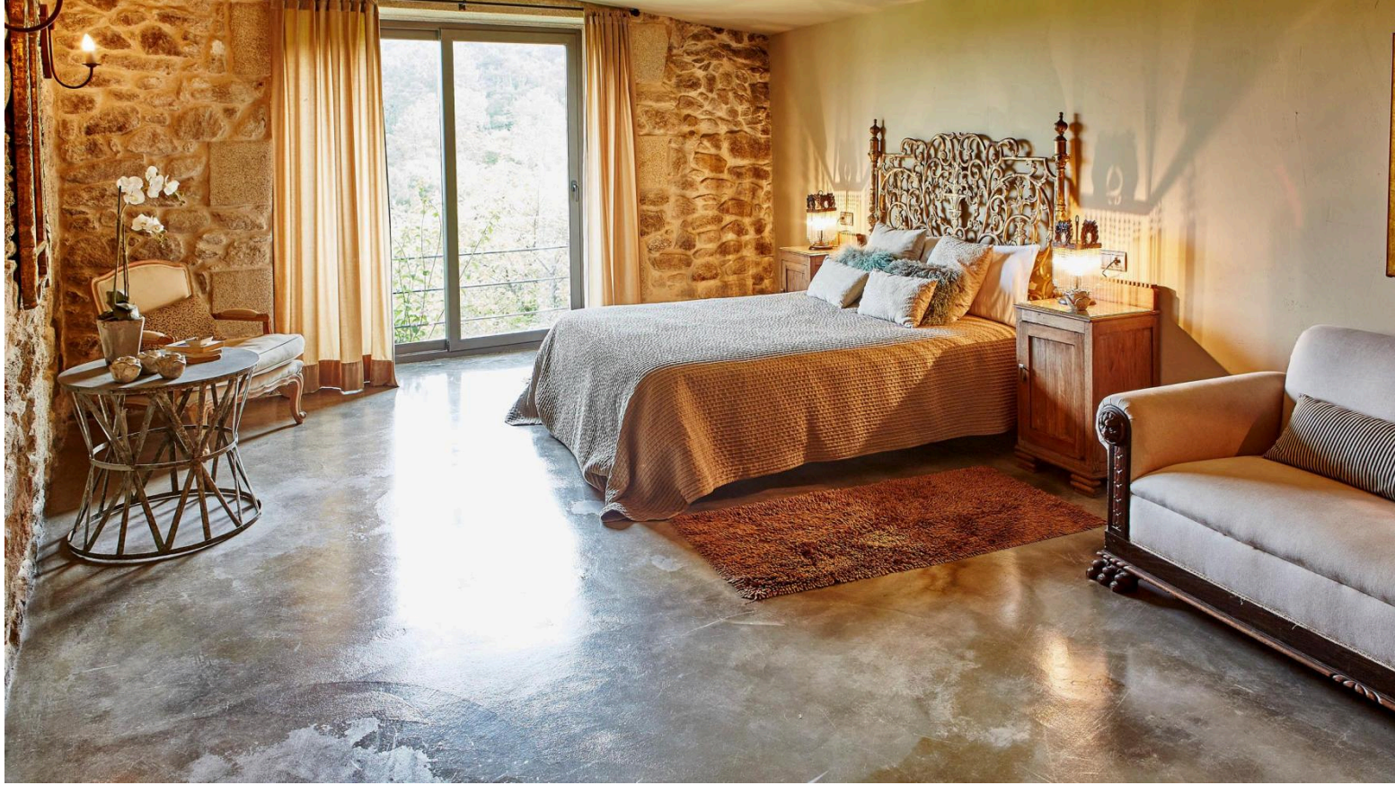
Villa Piloto, near Noia