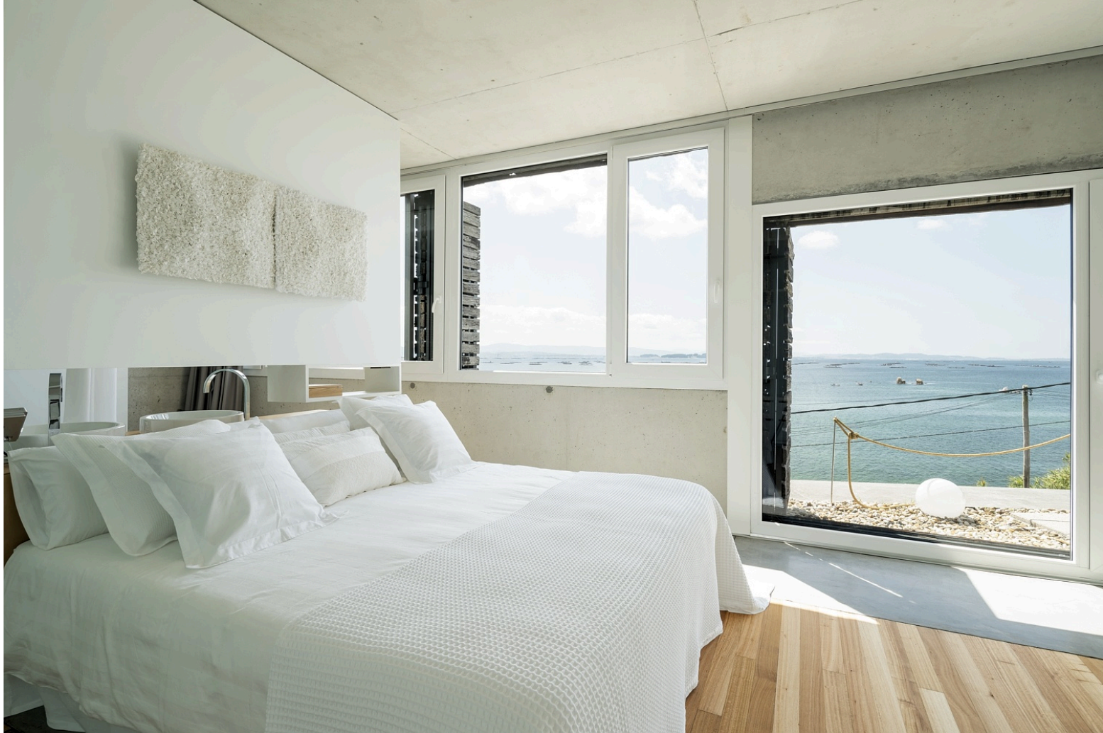
Dezanove House, A Coruña