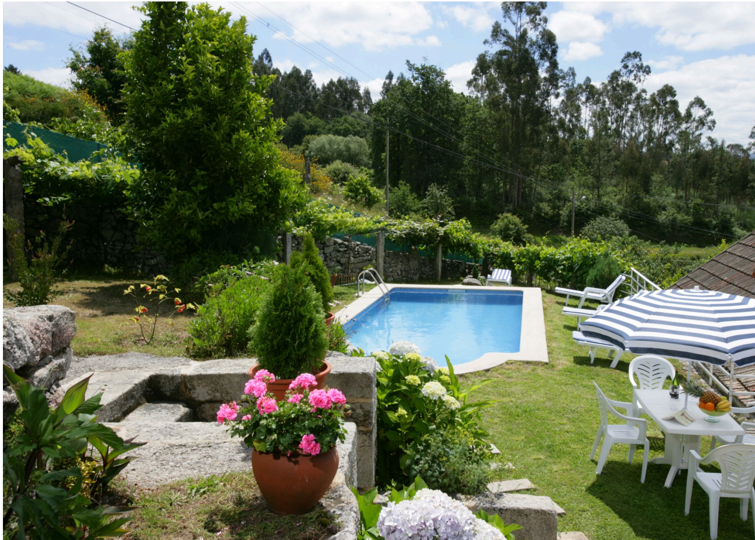
Pedriña do Barral, Mondariz-Balneario

Details Sleeps up to 13. Seven nights from £1,198 (vintagetravel.co.uk). Fly to Santiago de Compostela or Vigo