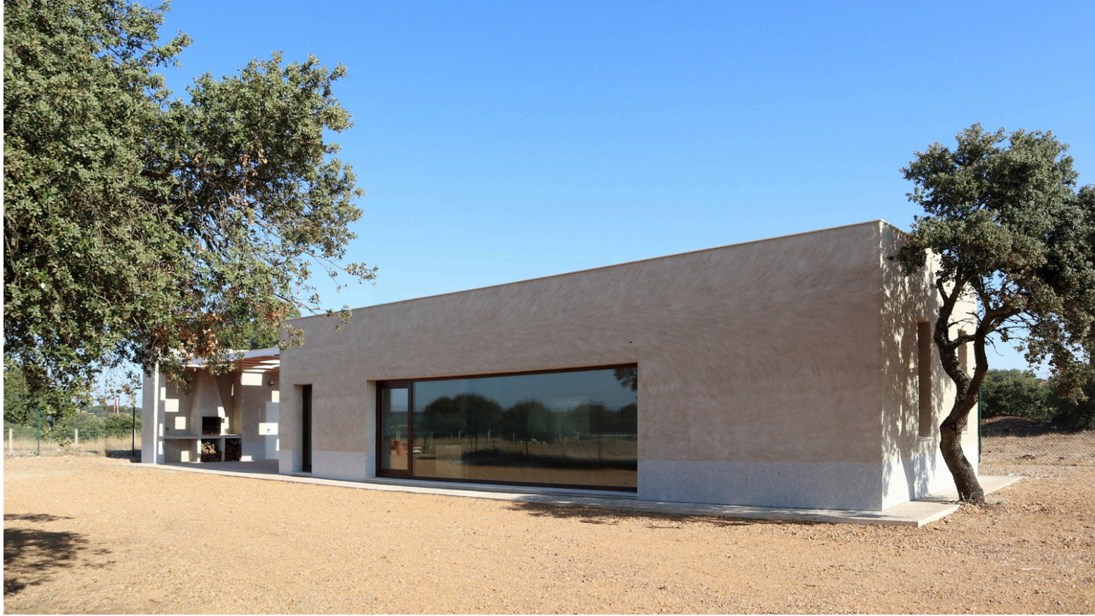
Refugio Cabin, Salamanca