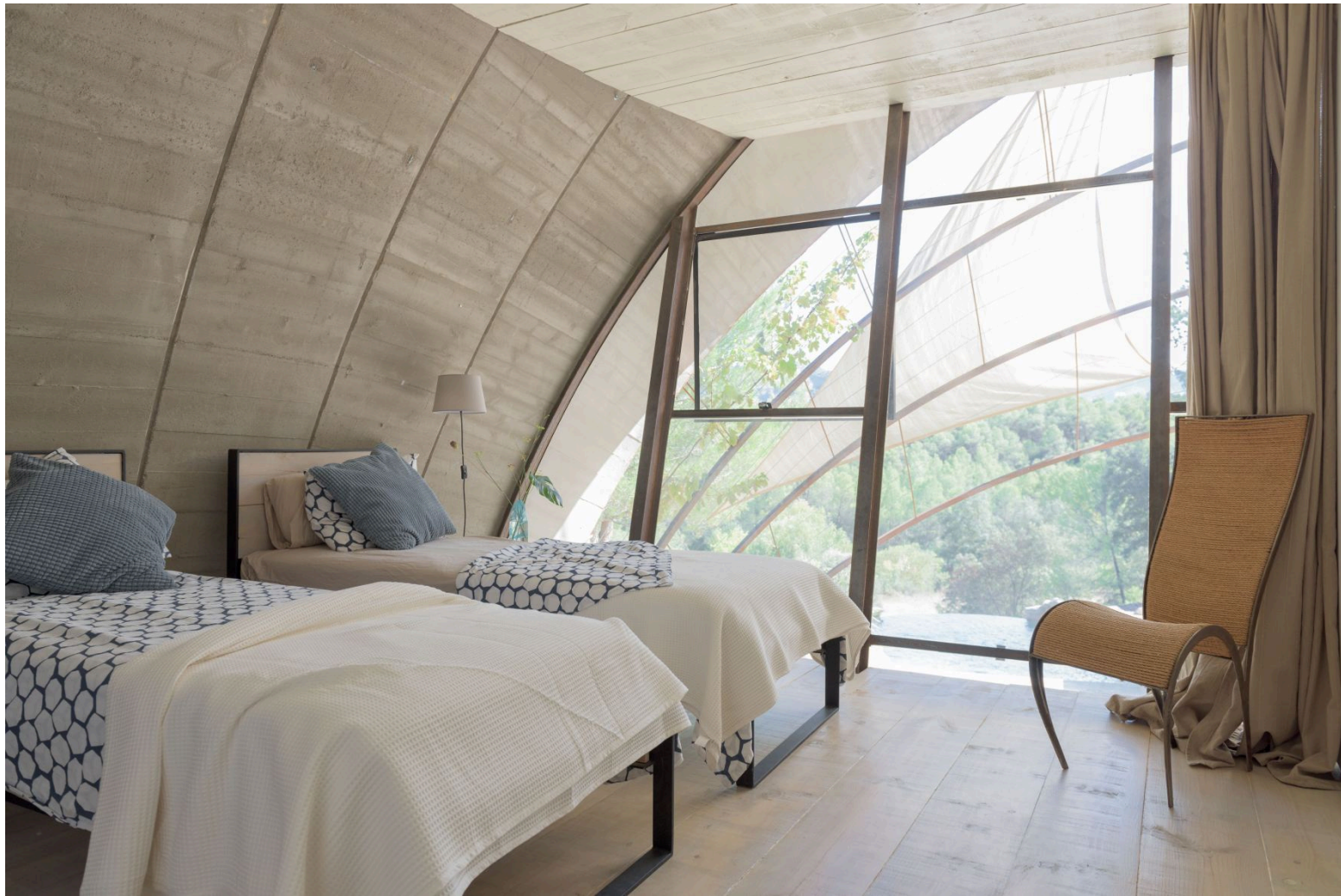
El Caracol, Lledo

Details Sleeps up to three. One night's B&B from £198 (welcomebeyond.com). Fly to Valencia or Barcelona