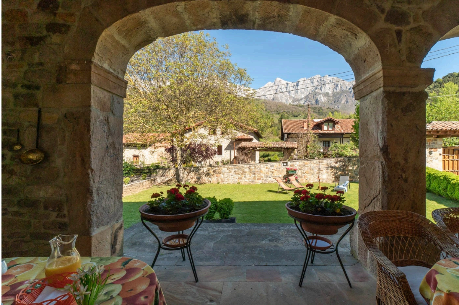
Villa with Inspiring Views, Picos de Europa