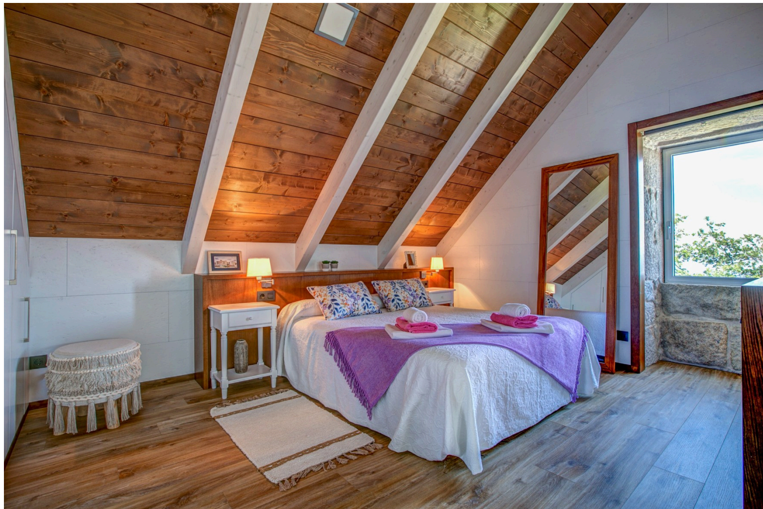
Los Tendales, Rias Baixas

Details Sleeps up to 12. Seven nights from £2,147 ( urlaubsarchitektur.de ). Fly to Santiago de Compostela or Vigo