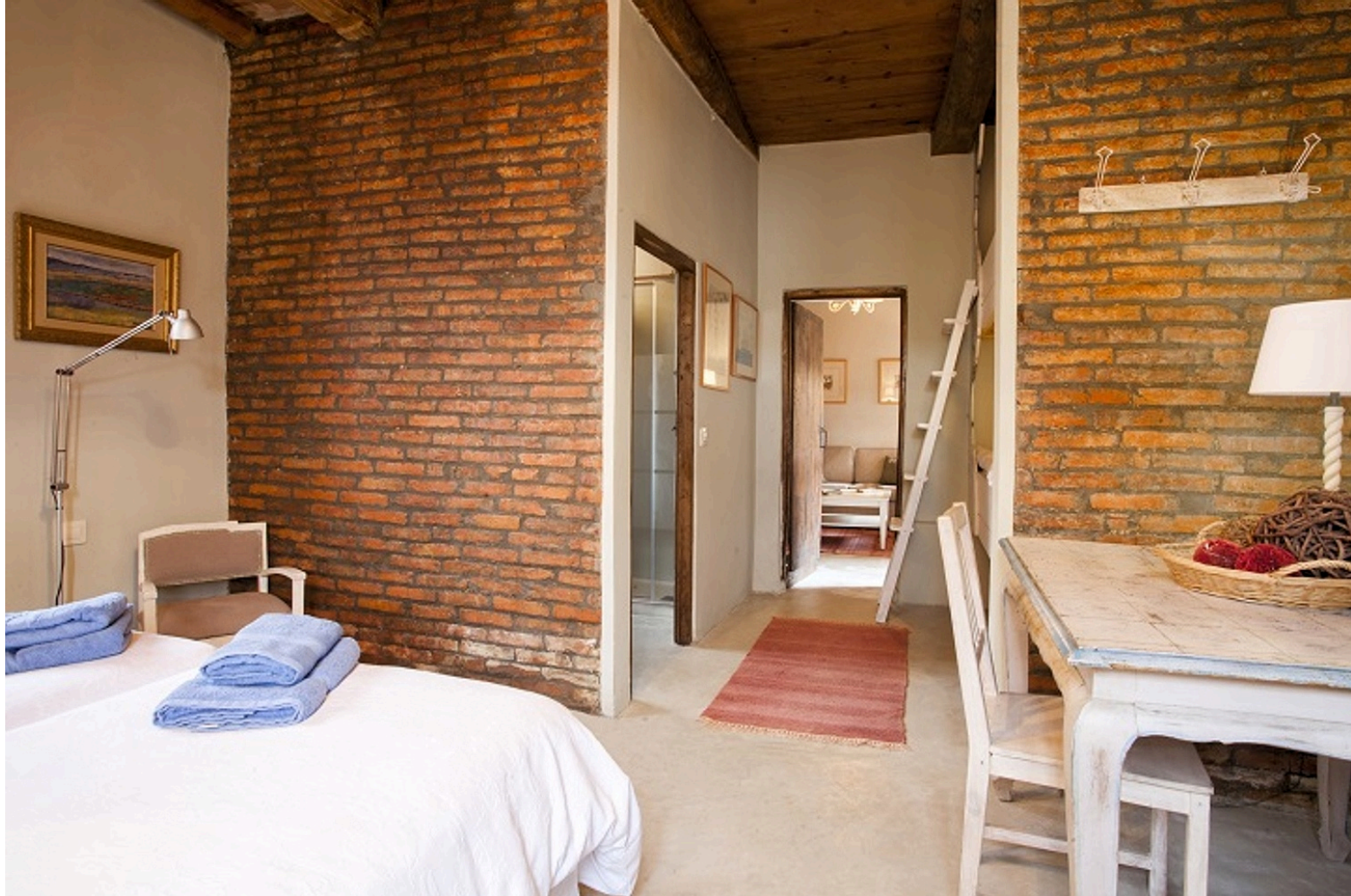
Villamejil, near Astorga