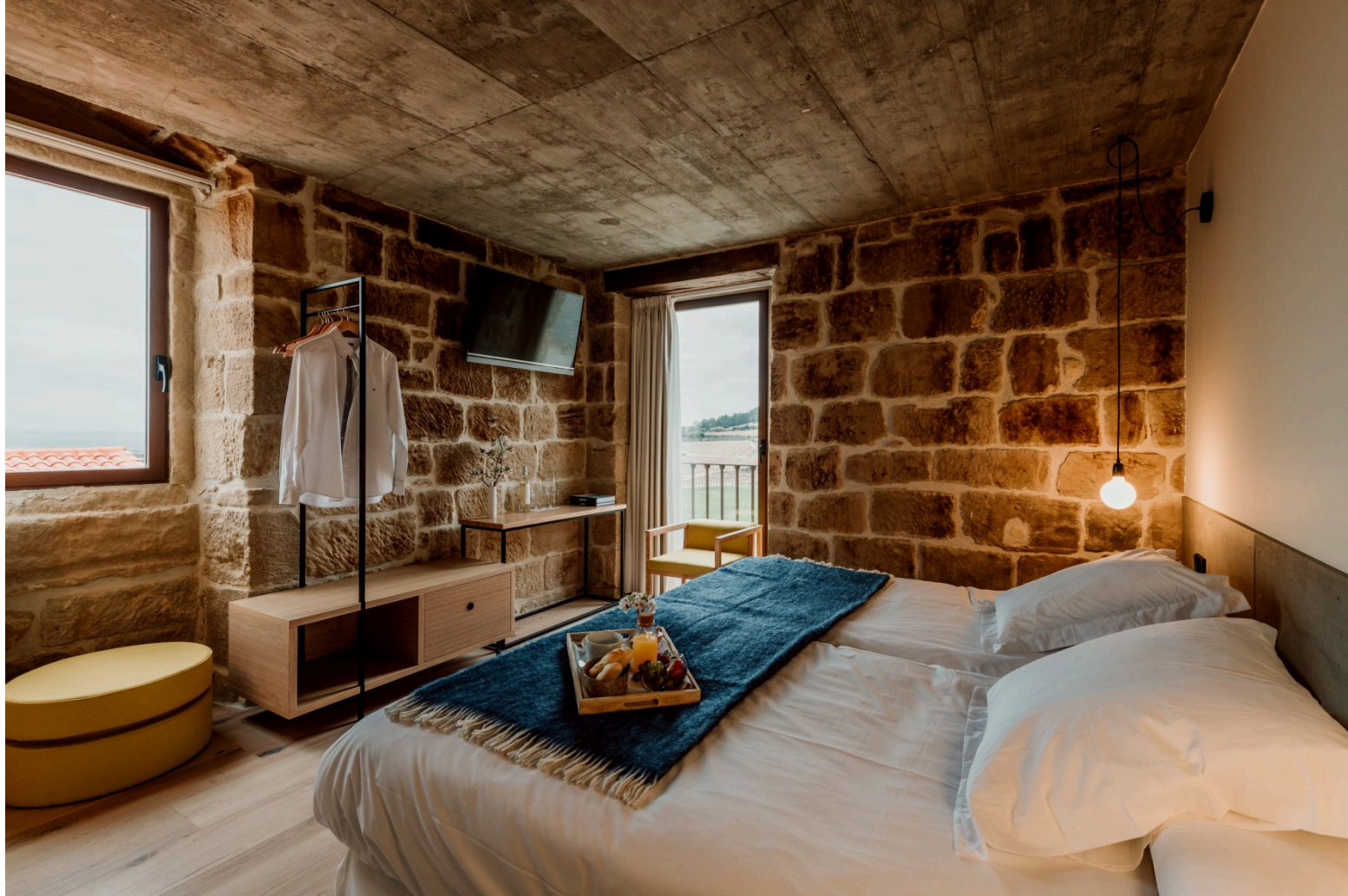
Palacio Condes de Cirac, Villalba de Rioja