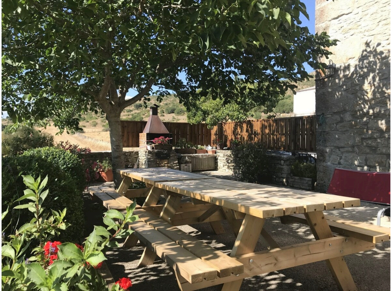
Leciaga Rural Cottage, Goni