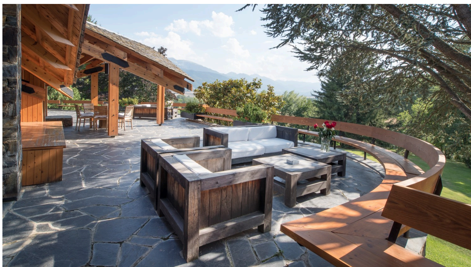
Pyrenees House, La Cerdanya

Forget the Costas — put these out-of-the-ordinary stays in northern Spain at the top of your list